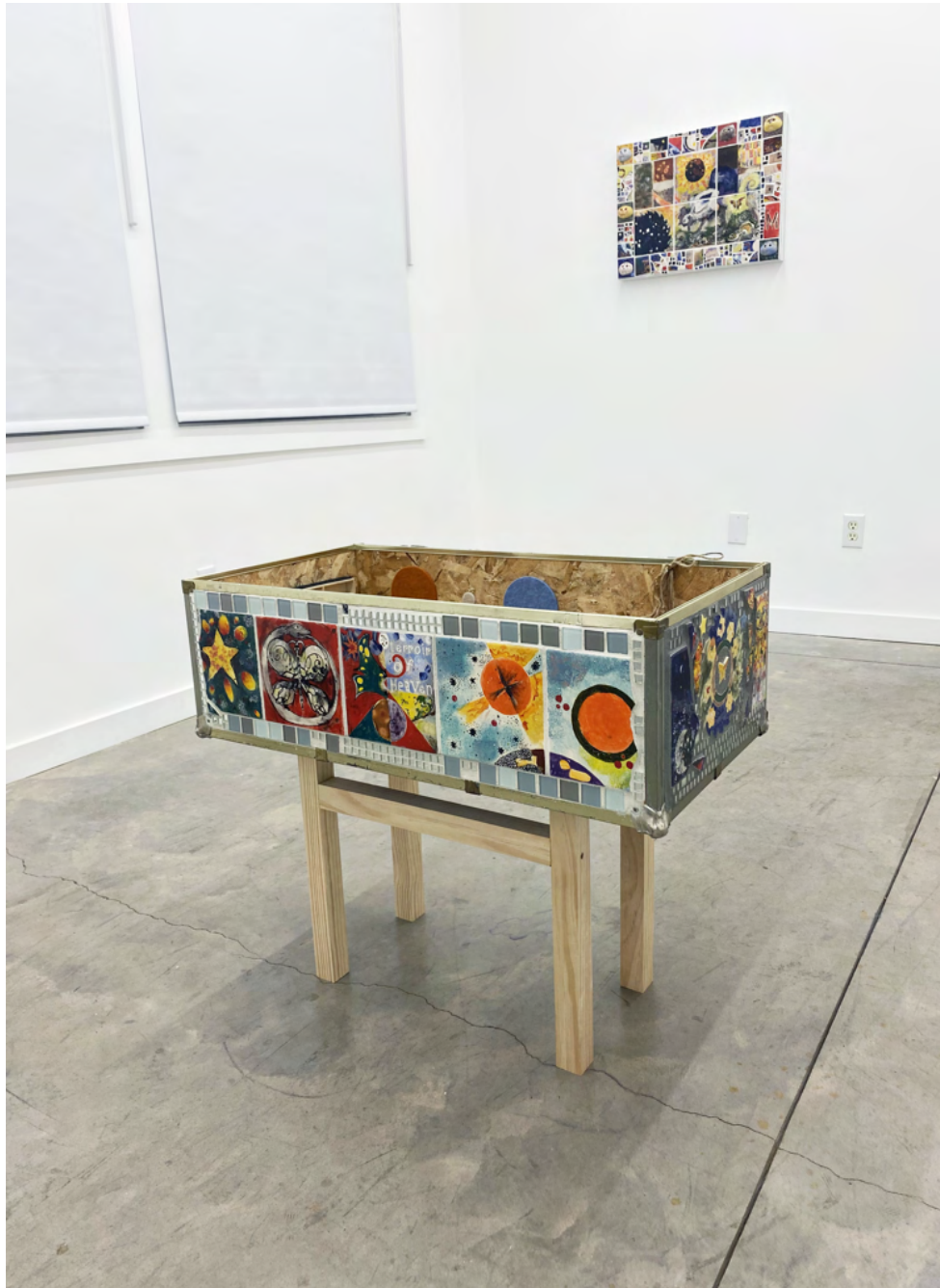
Jason Benson Sleeper , 2022 Mixed media 25.5 x 30.5 x 16.5 in $8,000